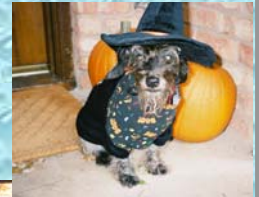
Scruff not having fun in her Halloween costume