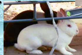
Flopser & Sugar, "The Girls" playing aound in the back yard