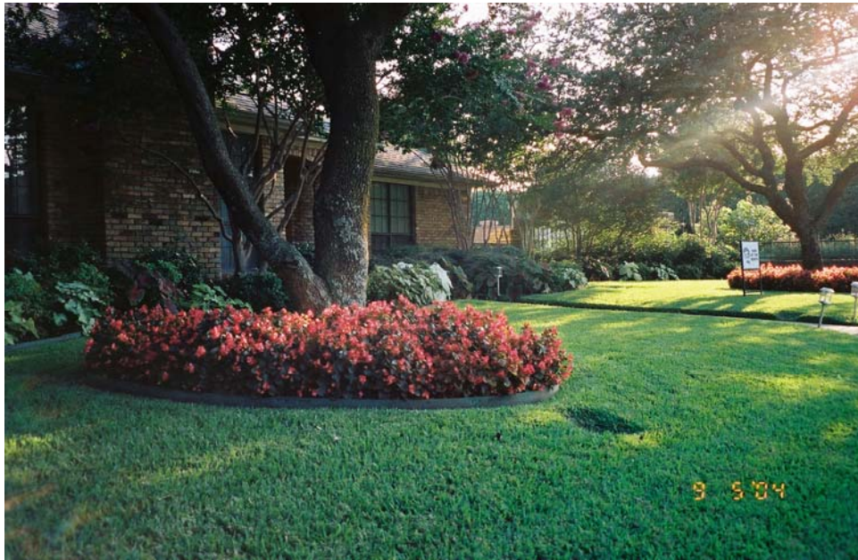
September's Yard of the Month Award, Terry Traveland 1936 Shadow Trail