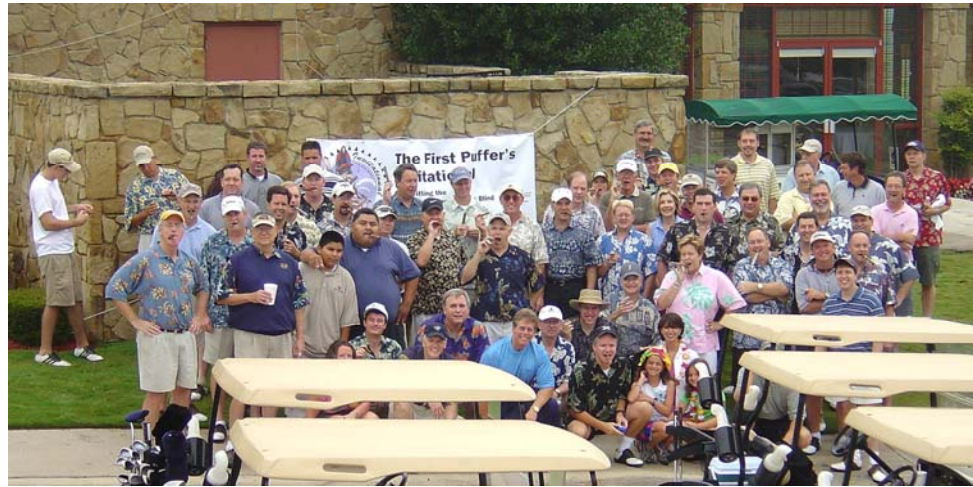
Proceeds of $5,000 raised for the Dallas Lighthouse for the Blind