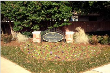
Beautification Projects See details on pages 5-6